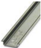
DIN rail, material: Steel, unperforated, height 7.5 mm, width 35 mm, length: 2 m

DIN rail, unperforated - NS 35/ 7,5 UNPERF 2000MM - 0801681