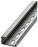
G-profile DIN rail, material: Steel, perforated, height 15 mm, width 32 mm, length 2 m

DIN rail perforated - NS 32 PERF 2000MM - 1201002