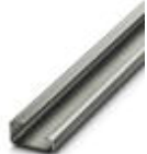
G-profile DIN rail, material: Steel, unperforated, height 15 mm, width 32 mm, length 2 m

DIN rail, unperforated - NS 32 UNPERF 2000MM - 1201015