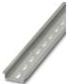
DIN rail, material: steel galvanized and passivated with a thick layer, perforated, height 7.5 mm, width 35 mm, length: 2000 mm

DIN rail perforated - NS 35/ 7,5 PERF 2000MM - 0801733