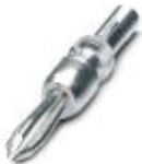
Test plugs, Color: silver